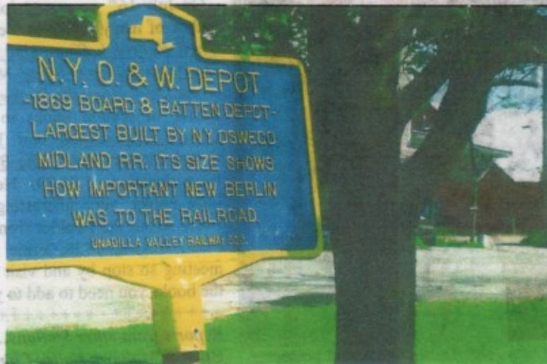
Historic marker on Genesee Street in New Berlin with (red) Unadilla Valley Railway Depot building behind the tree at 3 Railroad Street.

The Unadilla Valley Railway Museum & Society is a 501(c)3 tax-exempt organization chartered by the New York State Board of Regents. Checks payable to Unadilla Valley Railway Society & Museum may be sent to our P. O. Box 751, New Berlin, NY 13411.